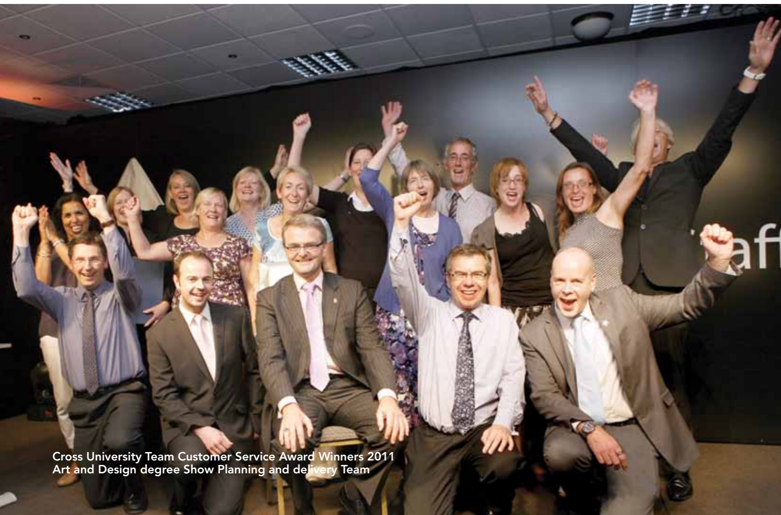
Cross University Team Customer Service Award Winners 2011 Art and Design degree Show Planning and delivery Team

The RSS Representatives Team carries out a vital role above and beyond their normal duties, gathering news and events information to share on the university blogs. They are nominated for the Customer Service Award for the big part they play in making the internal communications a success, helping to connect colleagues and keep them informed as the university progresses into the future.