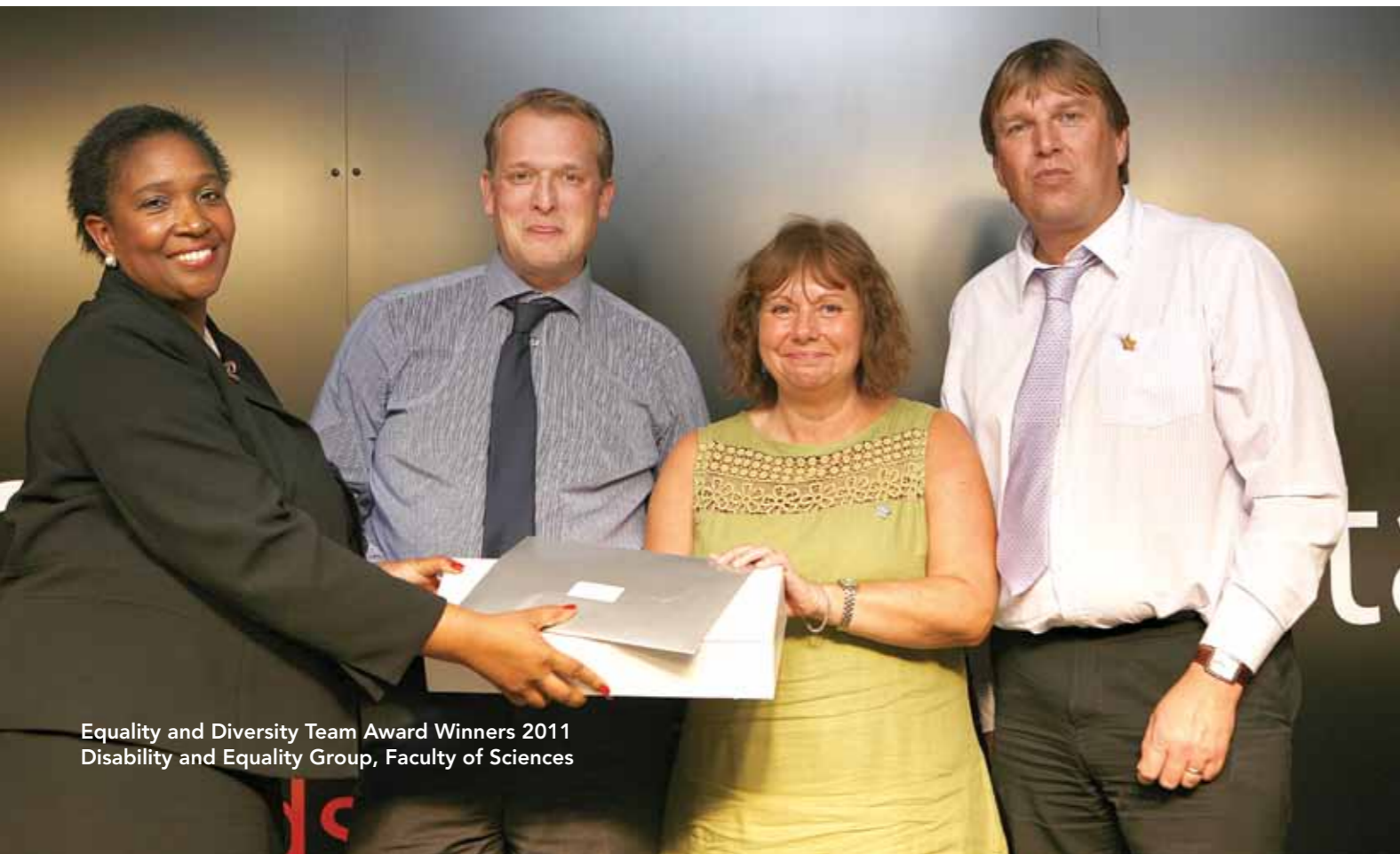
Equality and Diversity Team Award Winners 2011 Disability and Equality Group, Faculty of Sciences