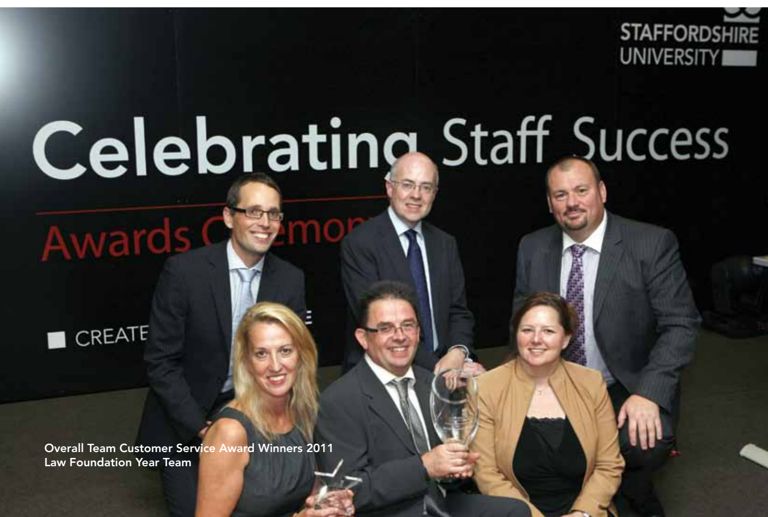
Overall Team Customer Service Award Winners 2011 Law Foundation Year Team