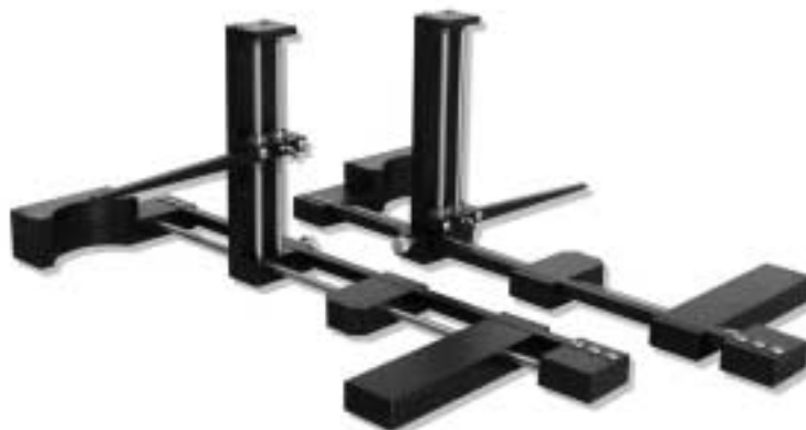
Figure 1. Arch Height Index Measurement System (AHIMS)