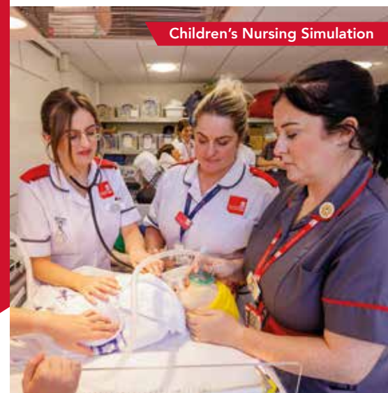
Children's Nursing Simulation