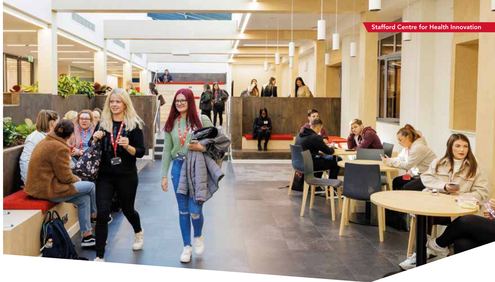
Stafford Centre for Health Innovation