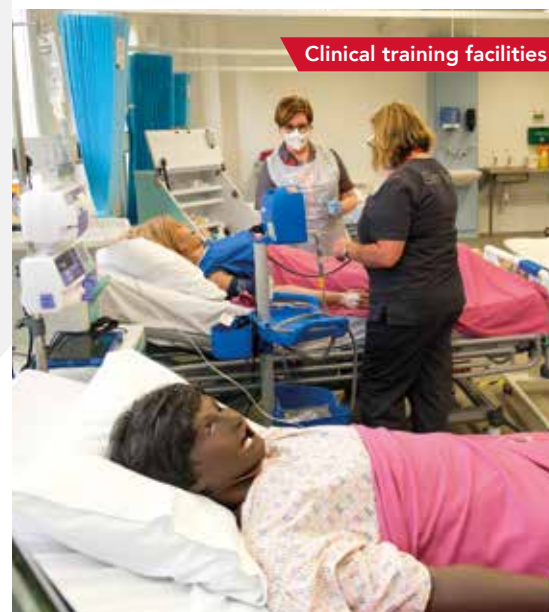
Clinical training facilities