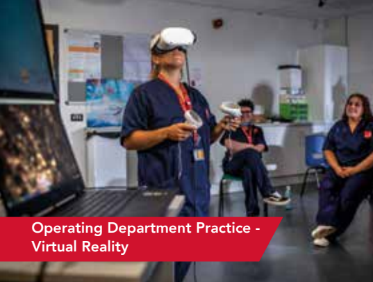
Operating Department Practice - Virtual Reality