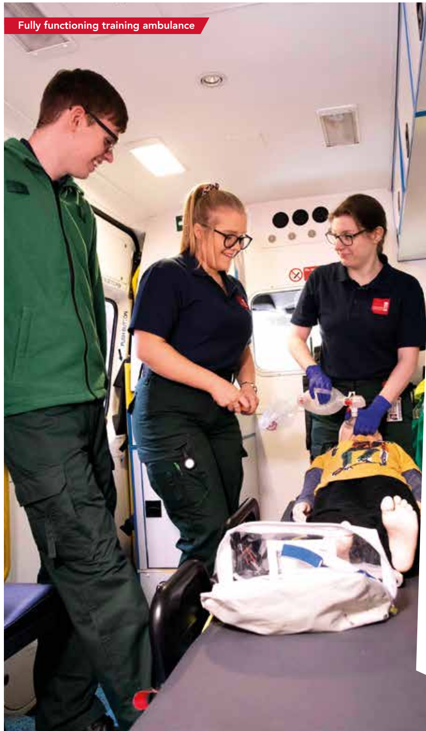
Fully functioning training ambulance