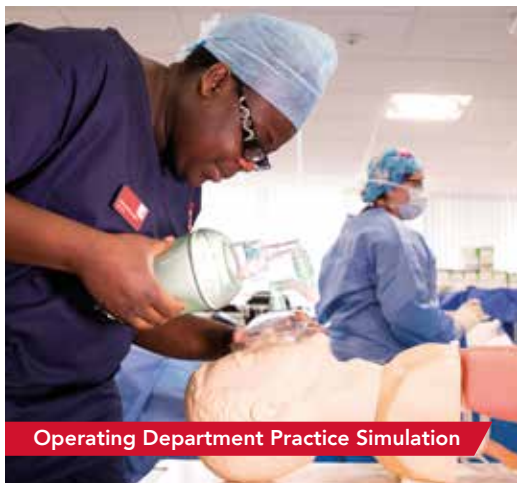
Operating Department Practice Simulation