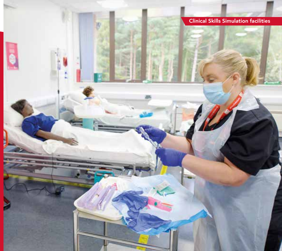
Clinical Skills Simulation facilities