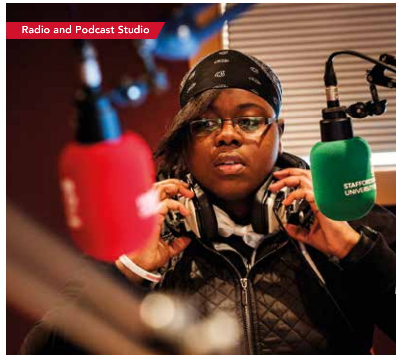
Radio and Podcast Studio