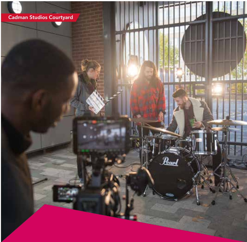
Cadman Studios Courtyard