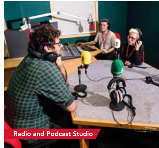
Radio and Podcast Studio