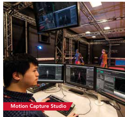
Motion Capture Studio

It means you won't study your specialism in isolation, but will have the confidence to work across different areas, such as digital media, film and live performance. Collaborative projects range from writers crafting lyrics for music artists through to joint work between theatre-makers and filmmakers.