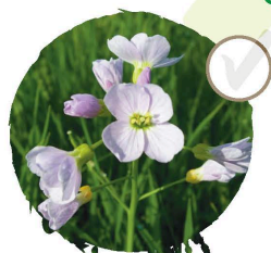
Cuckooflower See it: April–June