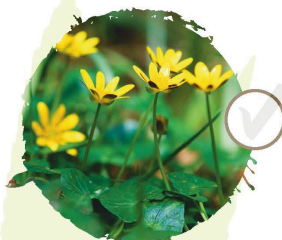
Lesser celandine See it: March–May