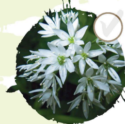
Ramsons (wild garlic) See it: April–May