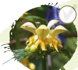
Yellow archangel See it: May–June