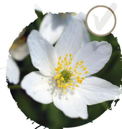
Wood anemone See it: March–May