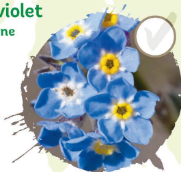
Wood forget-me-not See it: April–June