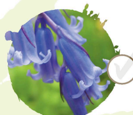
Bluebell See it: April–May