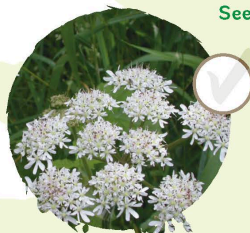
Cow parsley See it: May–June