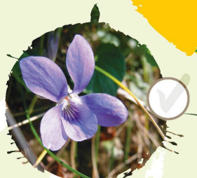
Common dog violet See it: April–June