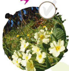
Primrose See it: December–May

Bright colours and delicate petals How many will you spot?