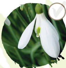
Snowdrop See it: January–March