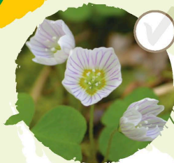
Wood sorrel See it: April–May