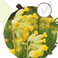
Cowslip See it: April–May