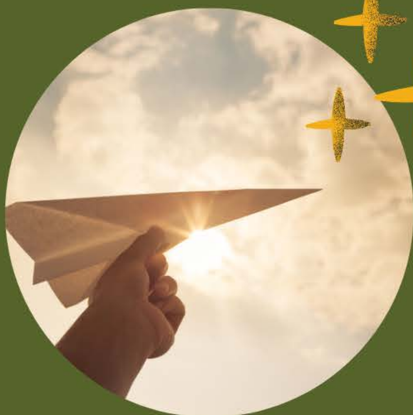
Paper aeroplane race!